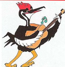
OUR FAVORITE NATIVE: PILEATED "WOODPICKER"