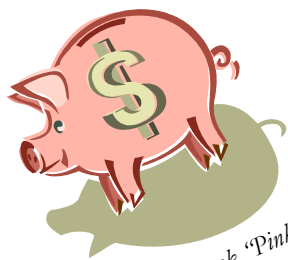
The Triple Creek "Pink Pig" is really losing weight... Please try to help him out!

Always check the web site for current activities and schedules!!!